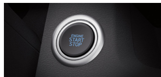
New Push Start Button*