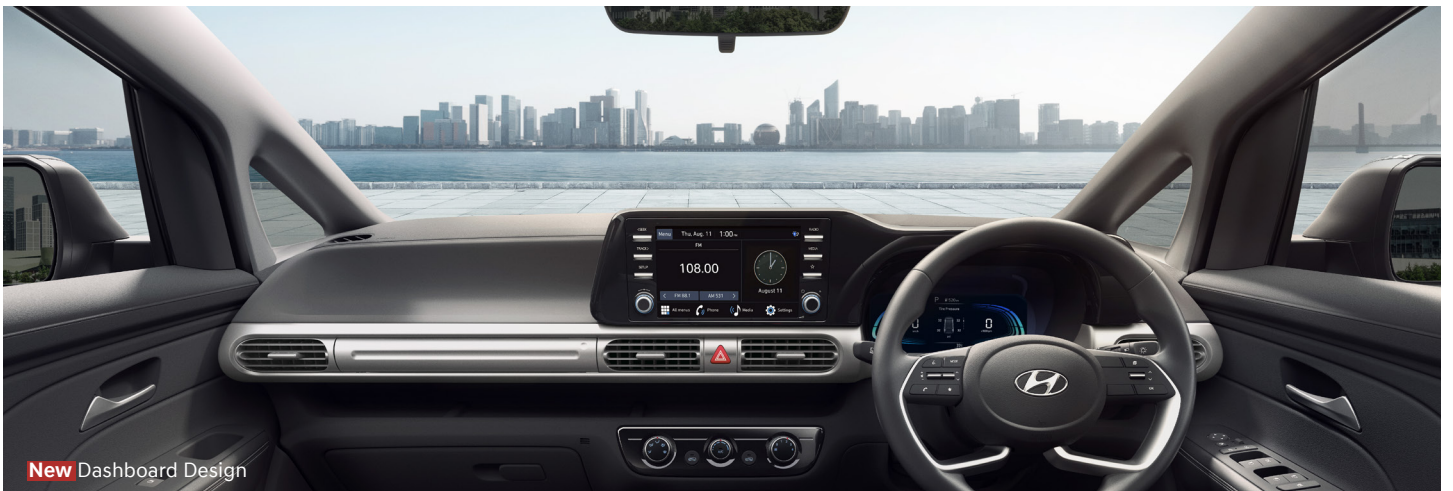
New Dashboard Design