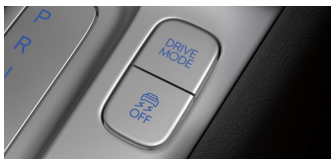
New Drive Mode (Normal, Eco, Sport, Smart)*