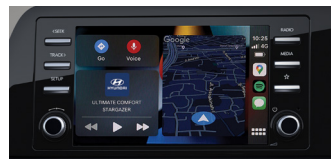
8" Touch display audio with Wireless Phone Connectivity