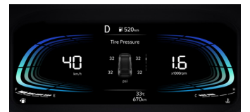
4.2" TFT LCD Cluster with Tire Pressure Monitoring System (TPMS)